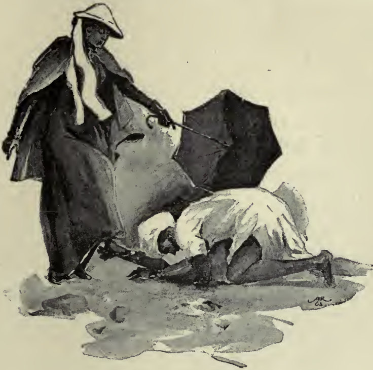
PUT MY FOOT ON HIS HEAD.

‘Well,’ I said, ‘if this were a civilised